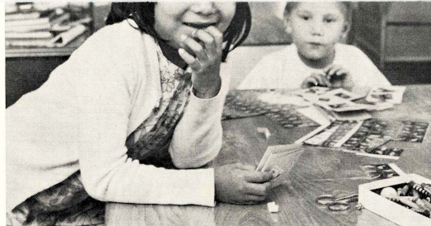
The aim is to create a new generation that is free of tuberculosis. A primary method is INH prophylaxis for special segments of the population who are now infected with the tubercle bacillus. The first target — the six-year-old positive reactor.