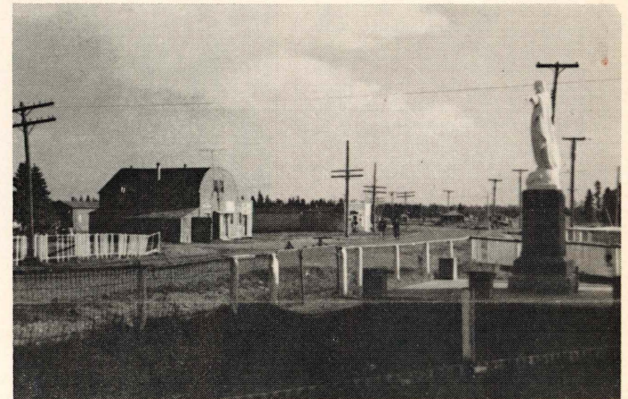
Main street, Camperville. Many of the 600 villagers find seasonal employment in fishing, cutting brush and picking berries and senega roots.

The troubles they poured out to the doctor sometimes had little to do with tuberculosis. Despite the fact that most of the men engage in some seasonal work, the money they make is not always enough to support their families and often they must depend on welfare assistance. Alcoholism and delinquency are growing problems. As soon as they are old enough to get