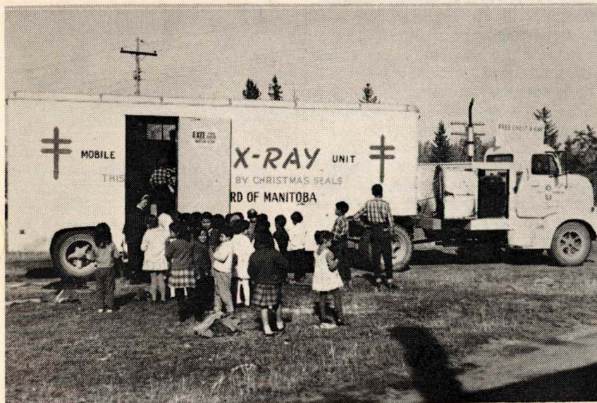
THE SANATORIUM BOARD'S X-RAY UNIT pays frequent visits to areas where the incidence of tuberculosis is higher than average. In the Duck Bay-Camperville area, where eight new active cases have been reported in the past two years, school children wait their