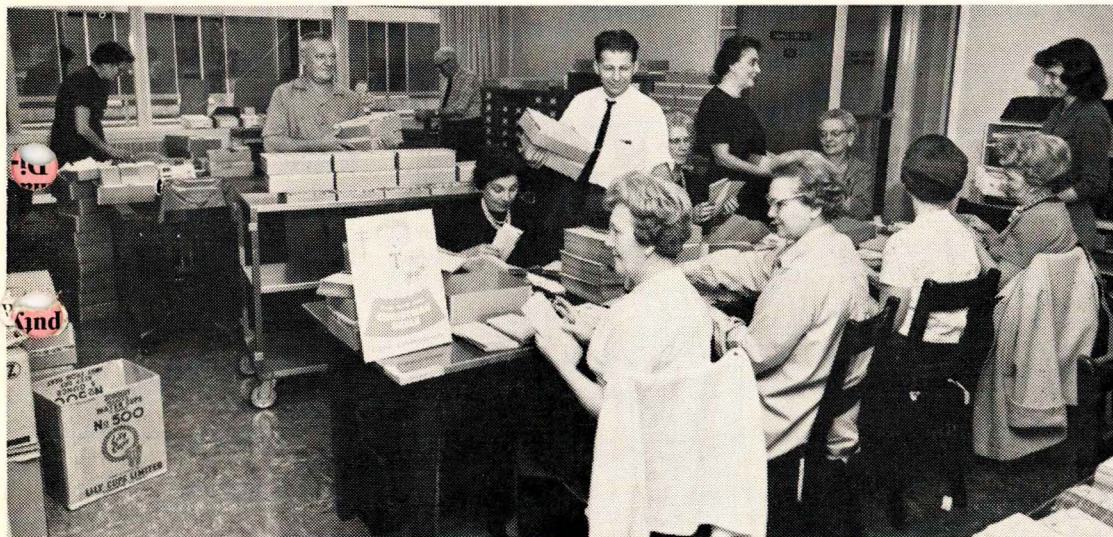
The Sanatorium Board's Christmas Seal office is bustling with activity these days as preparations are made for the 1964 Christmas Seal Campaign to raise funds for tuberculosis prevention. Among the volunteers who have been helping to stuff envelopes for mailing are a group of women curlers from Winnipeg, pictured here with Sanatorium