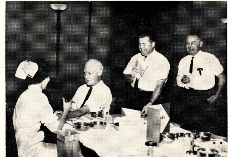
From left to right, the Hon. Gurney Evans, Minister of Industry and Commerce, the Hon. Sterling Lyon, Q.C., Minister of Mines and Natural Resources, and Walter Brattson of the Queen's Printer, cheerfully submit to the test. The survey lasted two weeks and during that time nearly 1,500 civil servants were examined. After completing the job, the surveys team set up headquarters in St. Boniface October 13 to begin a month-long survey.