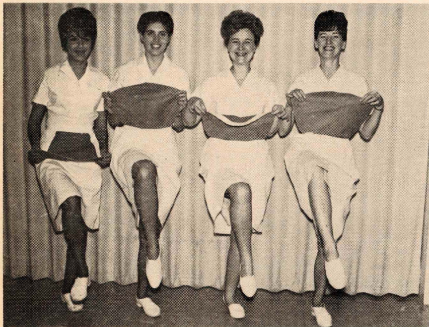
Our Cafeteria Colleens doing the Can-Can—or would you believe "You Ca'na Push Your Granny off the Bus"?

We've been sitting on this story a long time — waiting for the moment when our cameraman could actually catch these girls putting on one of their impromptu vaudeville acts for Sanatorium Board patients and staff.