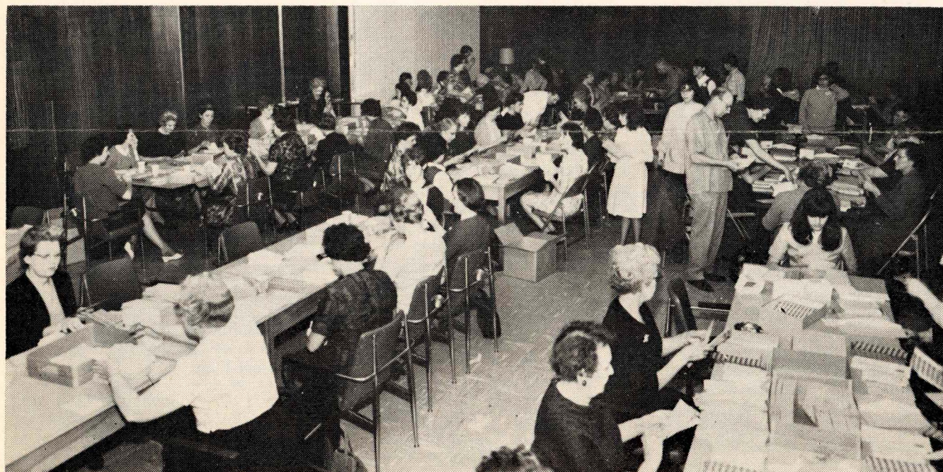
To help with preparations for this year's Christmas Seal Campaign, 125 Winnipeg business women (including Sanatorium Board staff members) gathered for a special "blitz night" October 19 in the auditorium of the rehabilitation hospital. Some 20 teen-age girls also helped out as well as a few male members of our pharmacy, portering and mailing room staff.