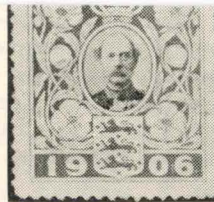
The 1906 Danish Christmas Seal portrays their king, Frederik VIII.

Humorous objects, such as an old hat, a worn-out broom or a queer toy circulated from post office to post office. At each office, the staff members added their Christmas Seals to the unwrapped object and sent it on to the next point of mailing.