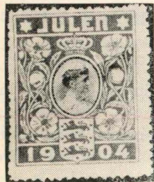
The first Christmas Seal in the world was sold in Denmark.

Holboell had seen many children on his daily rounds. He didn't like what he saw, and something swelled within his big frame. Here he was, sorting glad tidings from thousands of happy peo-