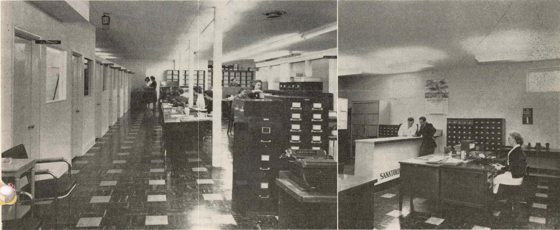
CHEERY, COMFORTABLE — INDEED, QUITE MODERN was the verdict given by members of the Sanatorium Board's head office when they moved into new, temporary quarters at 1654 Portage avenue on February 26. Pictured left are the offices of some

And indeed they were. For all agreed that for temporary quarters, and a bright, new future to look forward to, they certainly were doing all right.