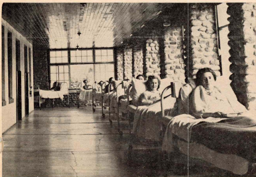
In the days before drugs and surgery, rest was considered most important to the patients' well-being. In warm weather and in cold, they often slept and ate on the screened balconies, their beds arranged in such a way that they had a good view of Pelican Lake stretching away into the distance.

Patients and staff benefited from his tremendous energy – an energy which seemed incredible in the light of his frail physical history. He was a kindly but strong-willed patriarch who expected only