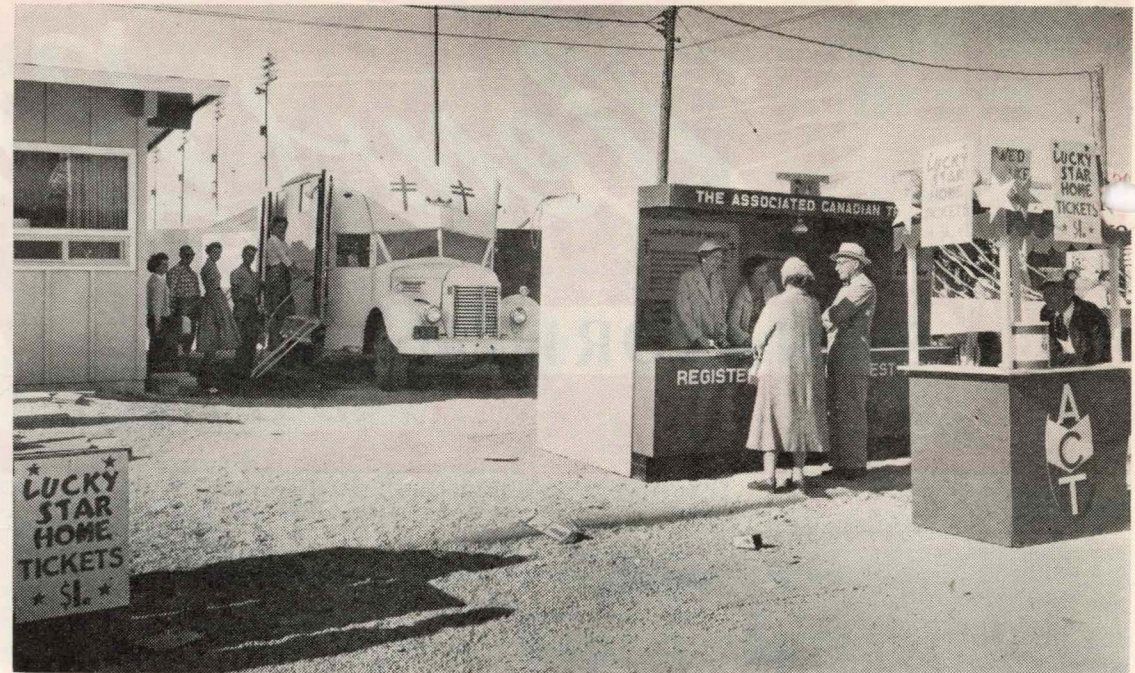
"BUY YOUR TICKETS TO THE A.C.T. LUCKY STAR HOME — AND HELP FIGHT TB!" was the call that rang out continuously at the Red River Exhibition in Winnipeg last month. And, as the picture shows, fair-goers responded with enthusiasm. After touring the sumptuous, six-room house, many people did register at the A.C.T. Ladies' Auxiliary booth (right foreground) for an X-ray examination at the Sanatorium Board van (right rear.)