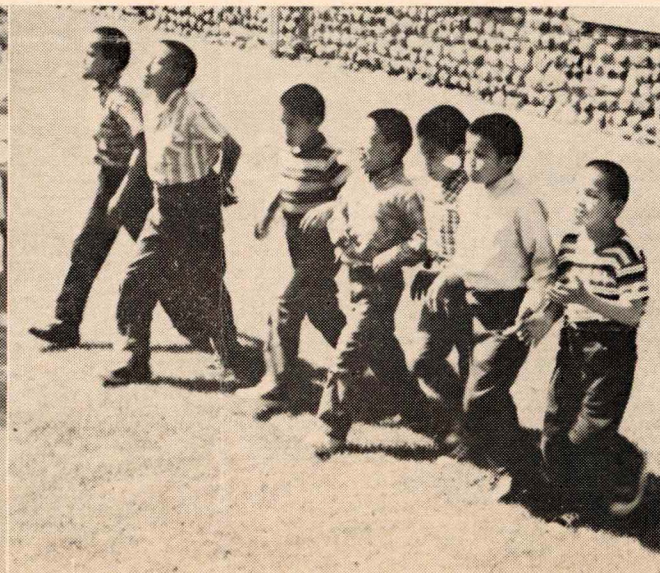
and a group of boys compete in an egg-and-spoon race.