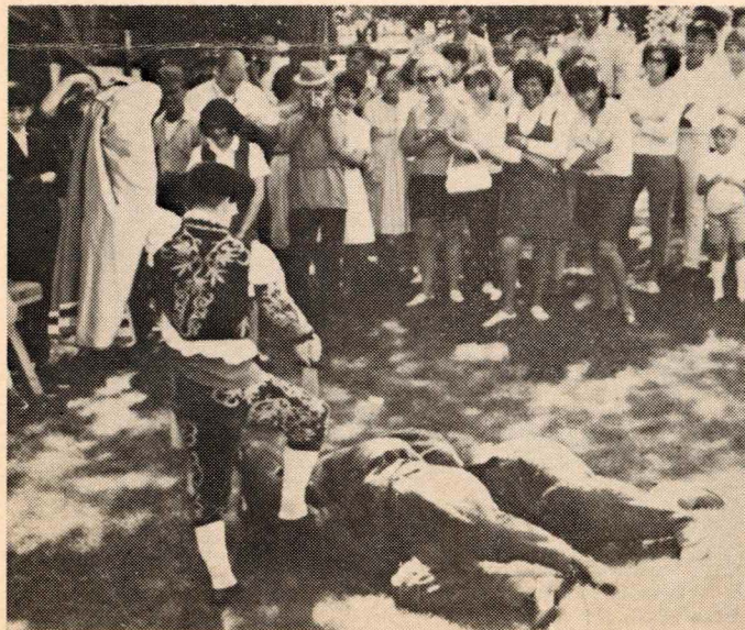
A dashing matador vanquishes a ferocious bull . . .