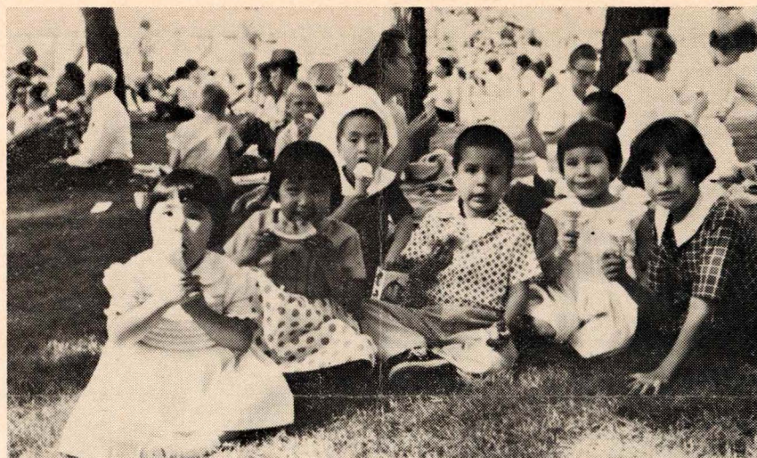
The watermelon and ice cream served on the tree-shaded lawns at Manitoba Sanatorium's annual picnic for patients and staff received the hearty approval of these little folk from Number One Pavilion.