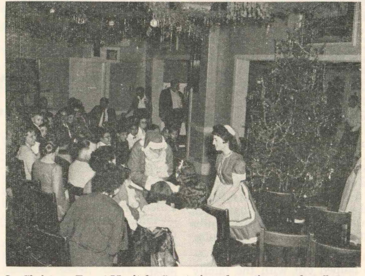
On Christmas Eve at Manitoba Sanatorium the patients and staff mem-

Christmas Eve at Manitoba Sanatorium was held in traditional style with patients and staff members taking part in a Christmas carol