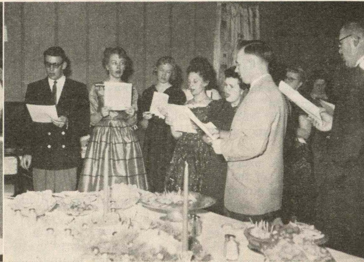
ren of Staff members. (Right) Numerous staff parties were held at all the SBM institutions during the holidays. A joyous round of carol singing preceded a Christmas dance and luncheon held for Assiniboine Hospital staff members at Sokol Hall in Brandon, December 16.