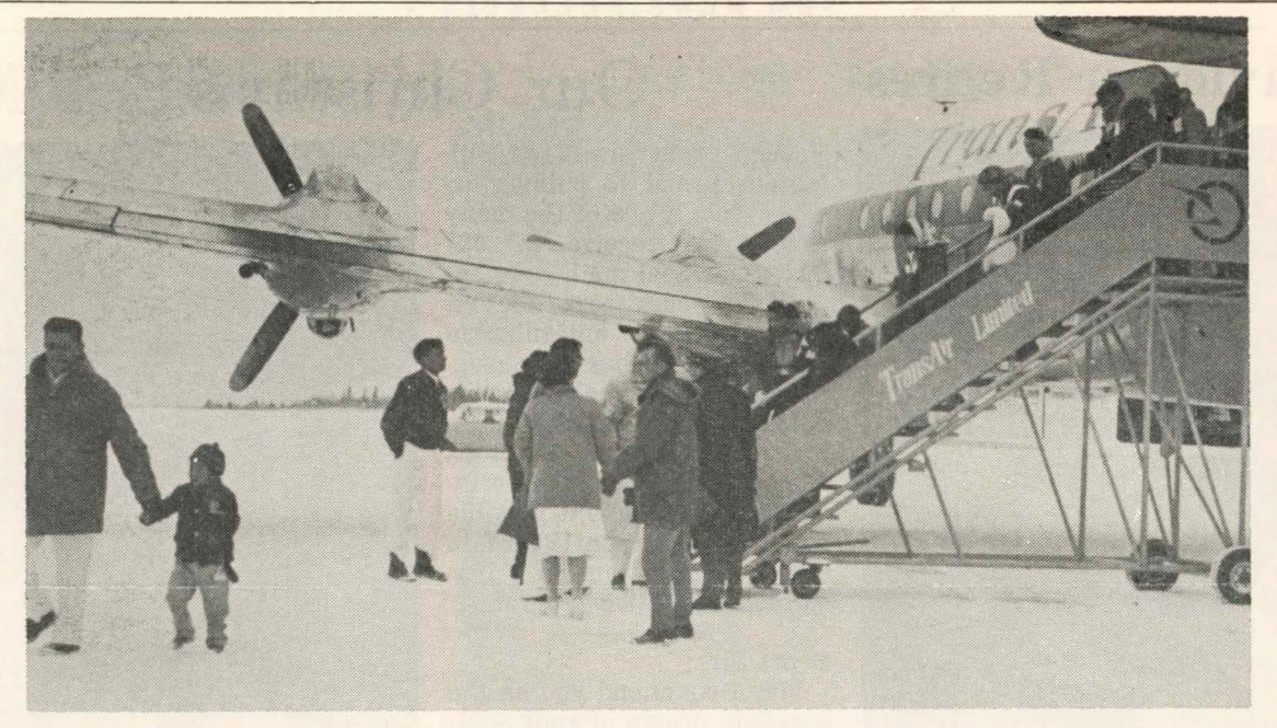
A PARTY OF 58 ESKIMO TB PATIENTS, originating from the Eastern Arctic, are shown arriving for treatment at the Sanatorium Board's Clearwater Lake Hospital near The Pas. The Eskimos were flown by a TransAir charter aircraft from Mountain Sanatorium in Hamilton, Ontario.

Each individual should consider the members of his own family. A person unknowingly tuberculous can serve a death warrant on all with whom he comes in contact. Tuberculosis is not inherited, but a tuberculosis person in constant association with