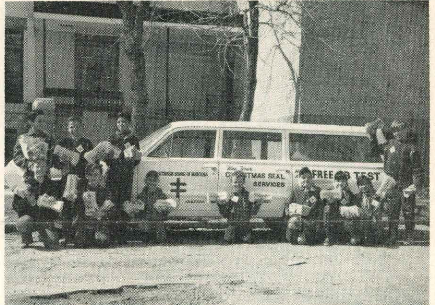
City Boy Scouts and young members of Neighborhood Services Centres (shown here) and the MacLean Mission gave up part of their Easter holidays to help the survey teams publicize the tuberculosis survey in Central Winnipeg this month. The survey, financed by the annual sale of Christmas Seals, is an important part of the Sanatorium Board tuberculosis preventive service for 1965. This district in Winnipeg was chosen for screening because it has a higher than average incidence of tuberculosis.