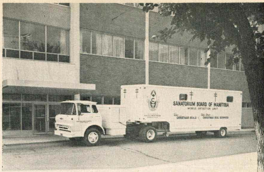
OUR NEW MOBILE VAN: "She's a beauty!" agreed the Sanatorium Board staff who strolled out to look at our new mobile detection unit one day early this month when it was parked outside the Central Tuberculosis Clinic on Bannatyne Avenue. The unit has already been put to work in south-western Manitoba where the Board's surveys teams are currently carrying out a combined tuberculosis and diabetes detection program.