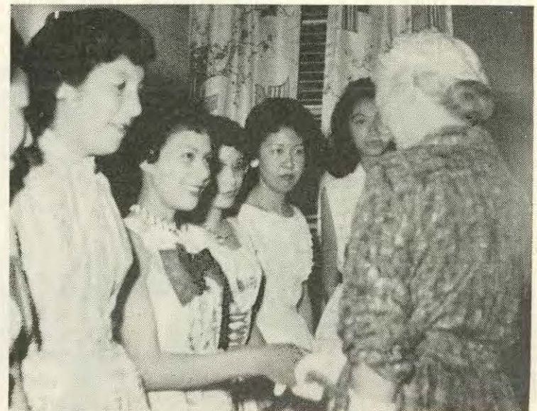
On hand to greet the Hon. Ellen Fairclough when she visited Assiniboine Hospital were these attractively dressed young girls from the hospital's rehabilitation unit. Mrs. Fairclough seemed intensely interested in this unit which provides special training for disabled Indian and Eskimo boys and girls who wish to work off the reserve.

Total rehabilitation is the aim for all. It begins as soon as the patient's disability is incurred or recognized and treated; it goes into full swing when the physician sends the patient to the rehabilitation unit for evaluation and re-training; and it finally culminates when that patient again assumes a useful happy place in his home and community.